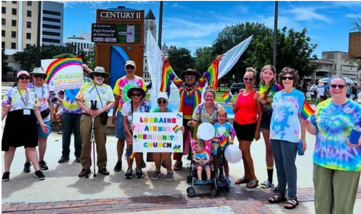
Photo caption: SCN member Lorraine Avenue Mennonite Church (KS) marches in their local Pride Parade