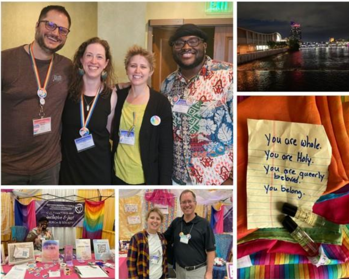
Photo caption: BMCers at 2024 Church of the Brethren Annual Conference in Grand Rapids, MI