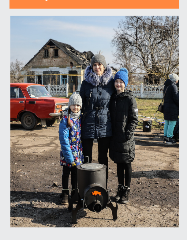
This family receives relief packages, including a new stove, from Uman Help Center. This is only possible because of your generosity.