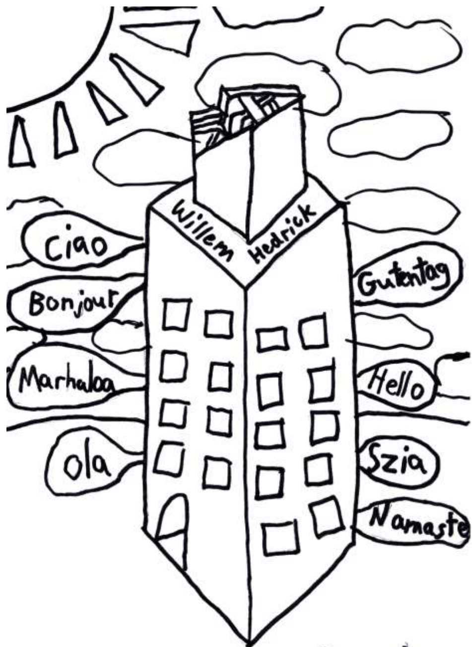
The Tower of Babel